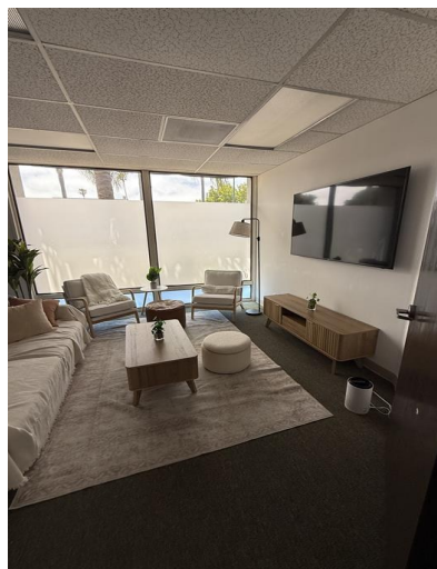
Interface Youth Drop In center, Oxnard

Interface’s Oxnard office is home to its Youth Crisis and Homeless Services department. Interface requested assistance in furnishing and remodeling a conference room space into a Youth Drop In Center. The vision and hope for the space was to provide a safe location where youth ages 12-24 can access needed resources, receive case management, and participate in group activities with peers in the program. CTO funded the remodel of the conference room space to help Interface bring this vision to life.